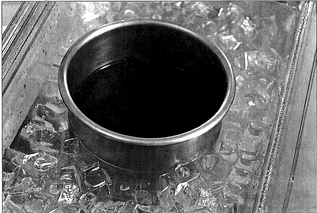
Figure 6.6: Step 1—Place stock into a stockpot, and then place the pot into an ice-water bath.

Note: Be careful not to put a large stockpot of hot stock in the cooler. It will warm the cooler and its contents.